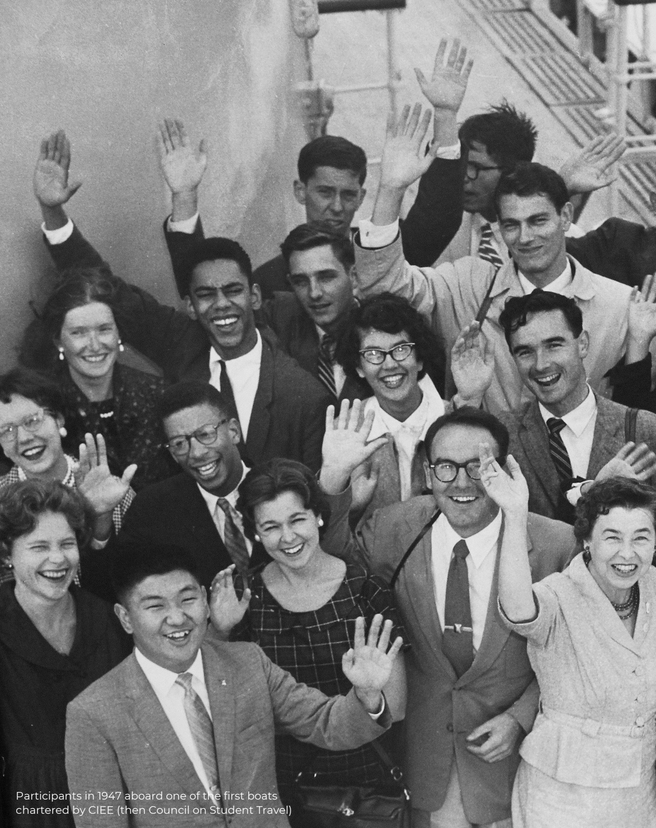
Participants in 1947 aboard one of the first boats chartered by CIEE (then Council on Student Travel)