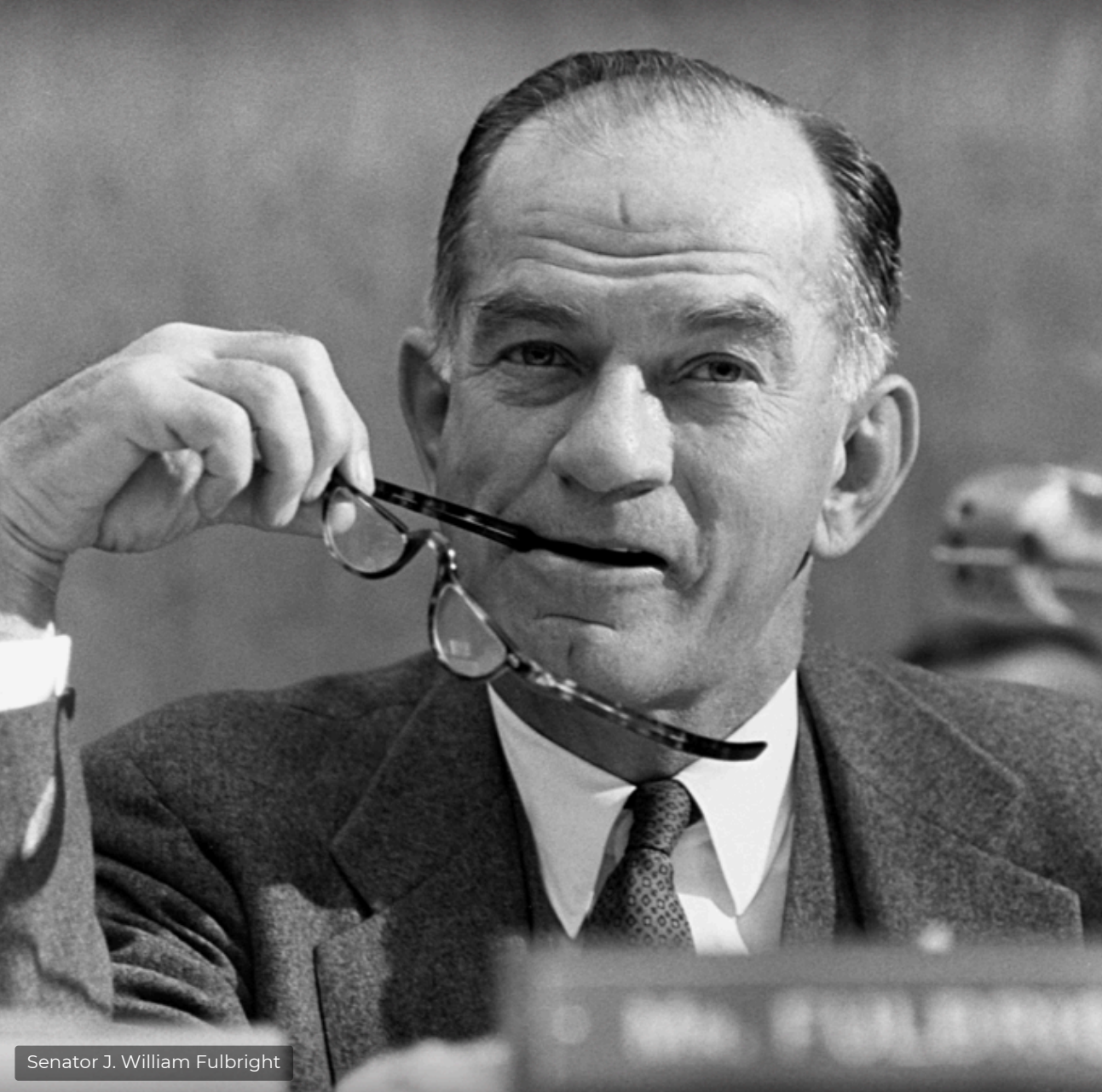
Senator J. William Fulbright