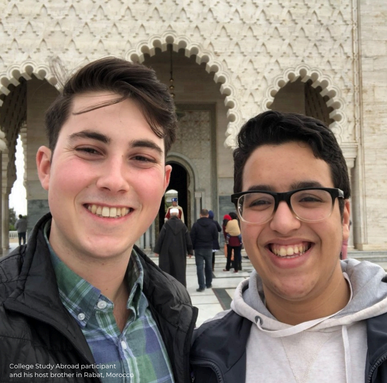
College Study Abroad participant and his host brother in Rabat, Morocco