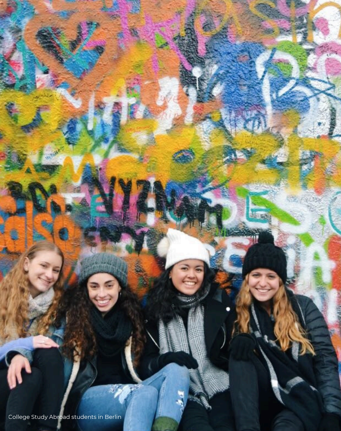
College Study Abroad students in Berlin