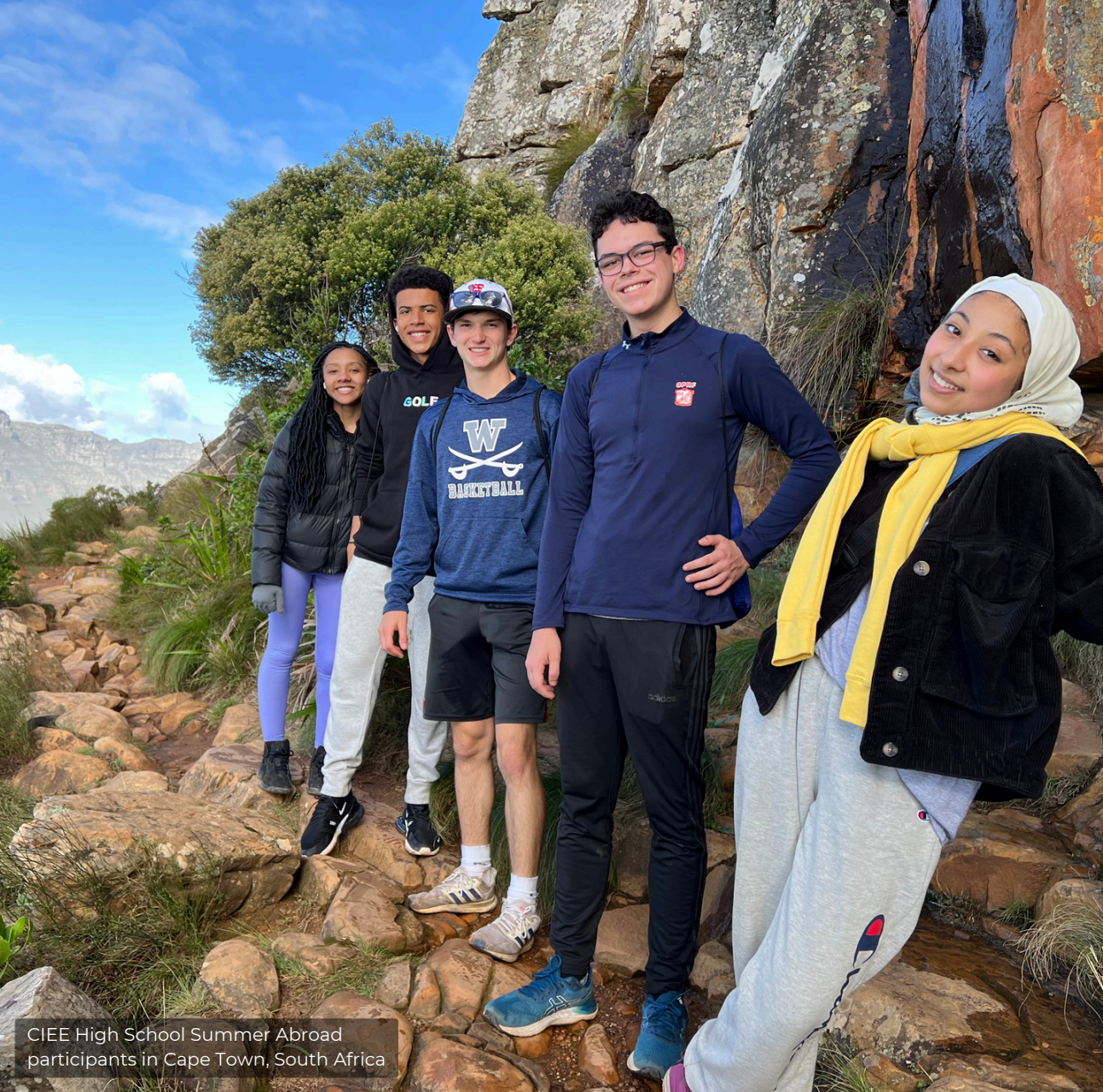
CIEE High School Summer Abroad participants in Cape Town, South Africa