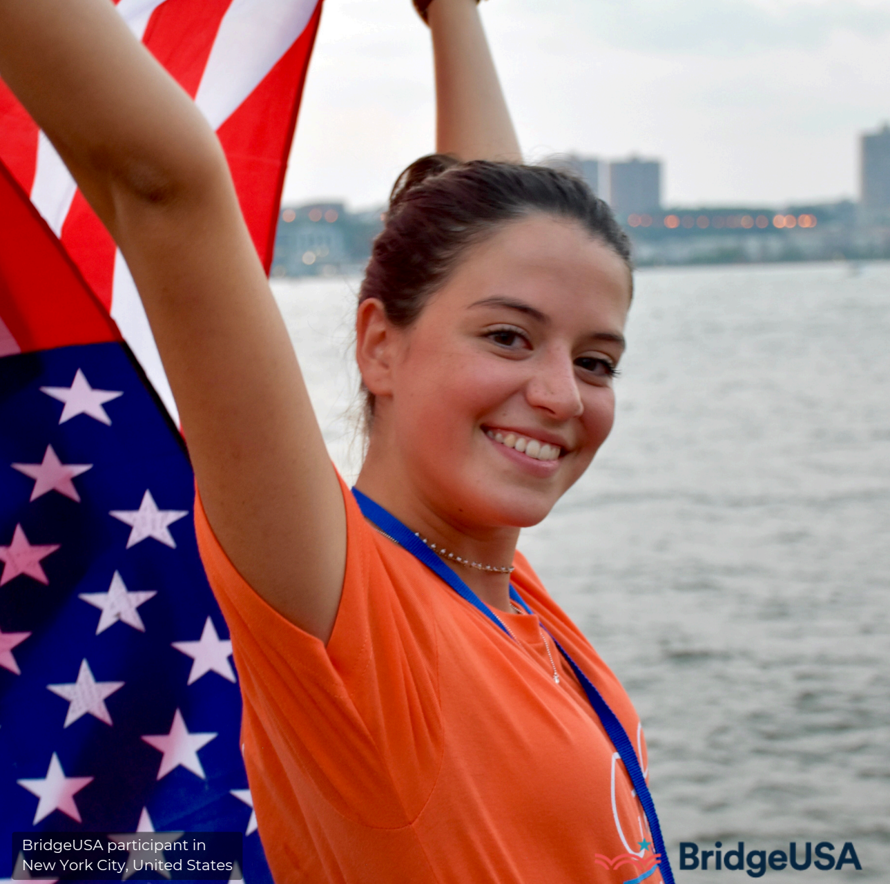
BridgeUSA participant in New York City, United States