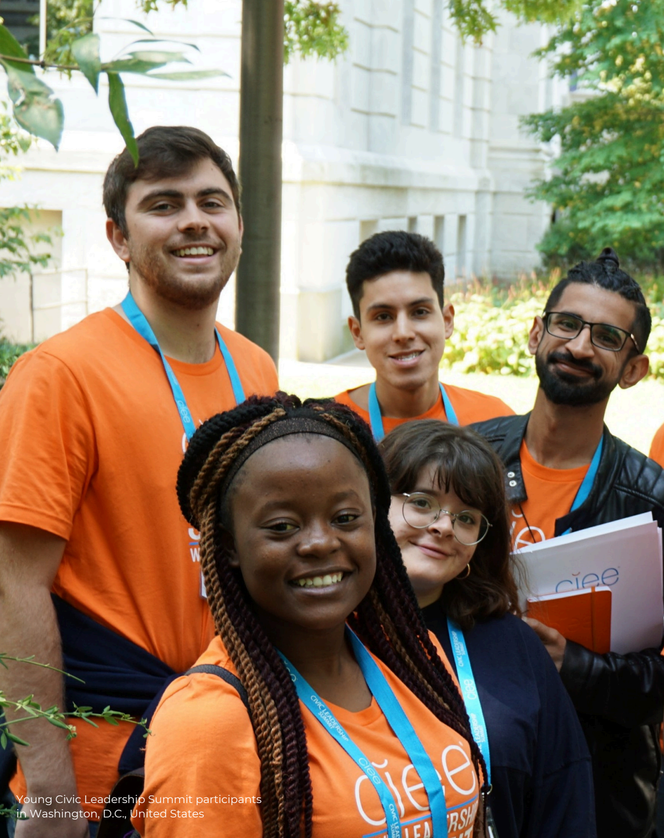
Young Civic Leadership Summit participants in Washington, D.C., United States