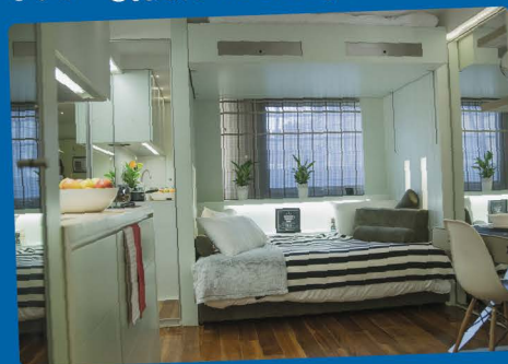
Studio Housing in London