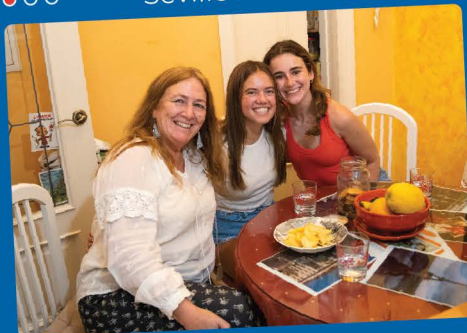
Seville Host Family